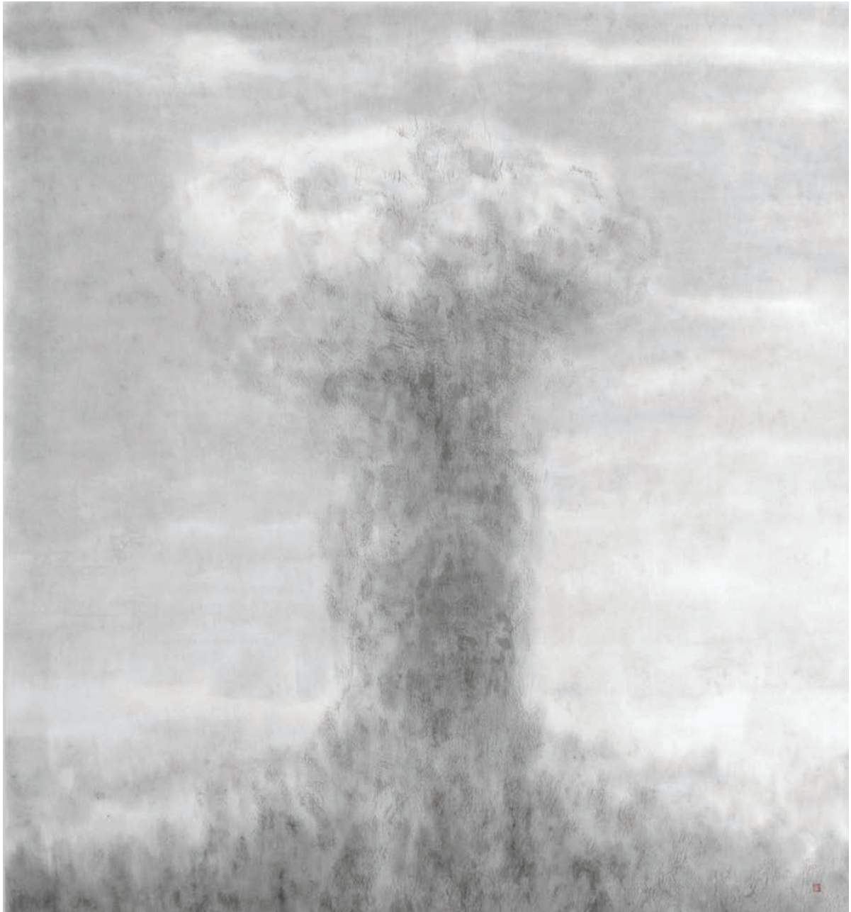
The Cloud #2, 2015. Chinese ink on rice paper, 97 x 90 cm