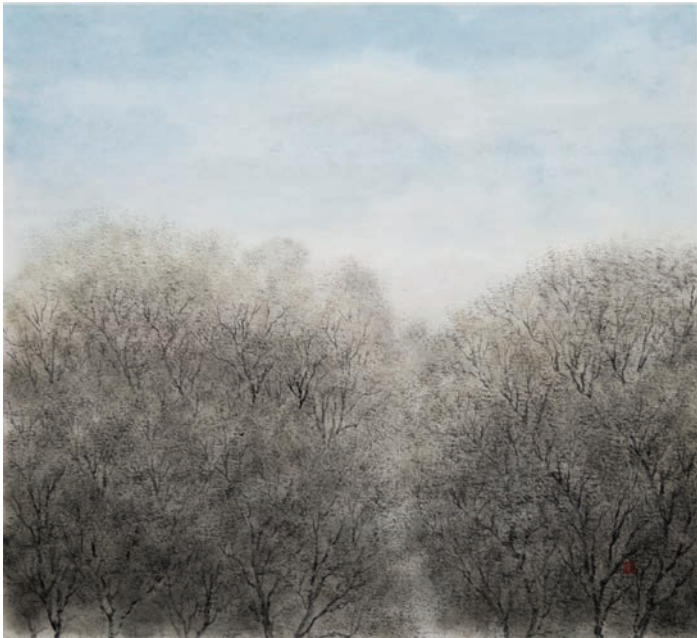
After eden #0215, 2015. Chinese ink on rice paper, 45 x 48 cm