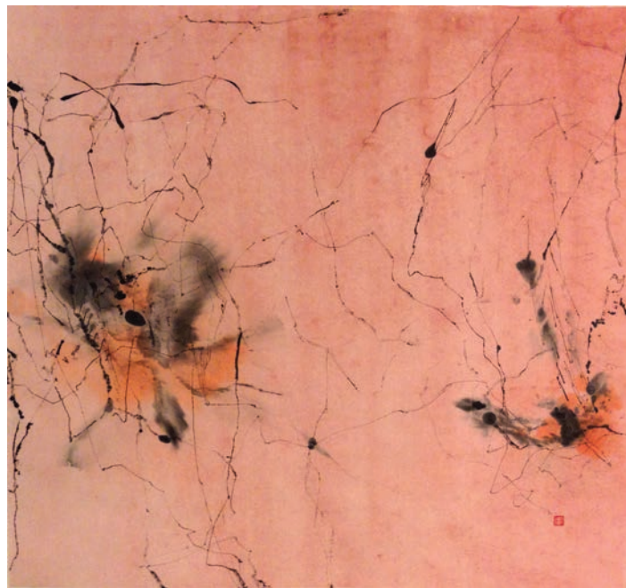
Trace #0215, 2015. Chinese ink on rice paper, 45 x 48 cm