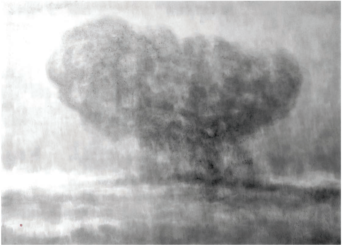
The Cloud #3, 2015. Chinese ink on rice paper, 97 x 135 cm