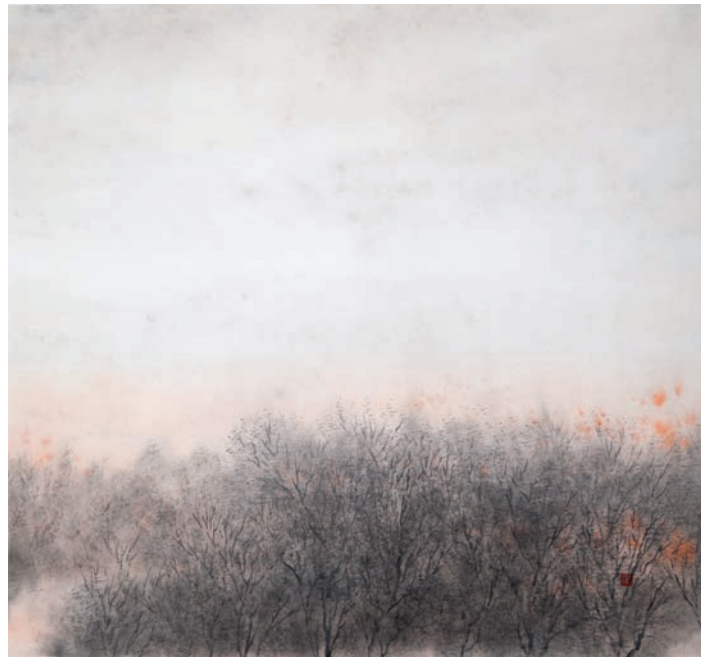
Wetland #0615, 2015. Chinese ink on rice paper, 45 x 48 cm