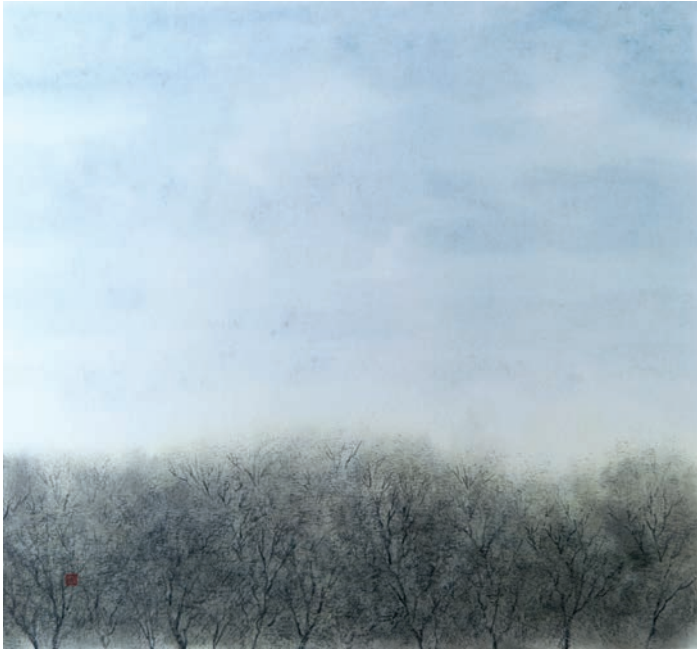
The rain is coming #0115, 2015. Chinese ink on rice paper, 45 x 48 cm