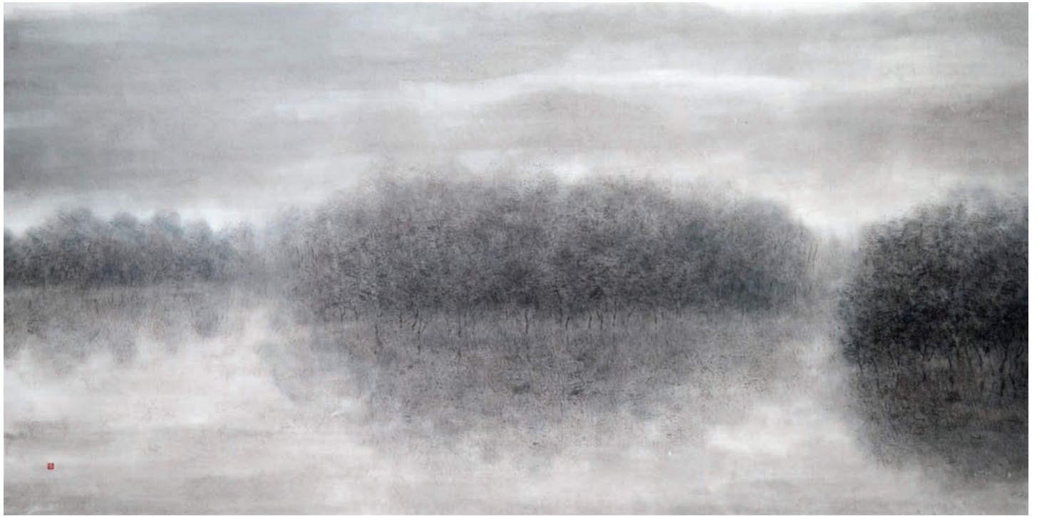
Wetland #0815. 2015. Chinese ink on rice paper, 69 x 138 cm (Private Collection)