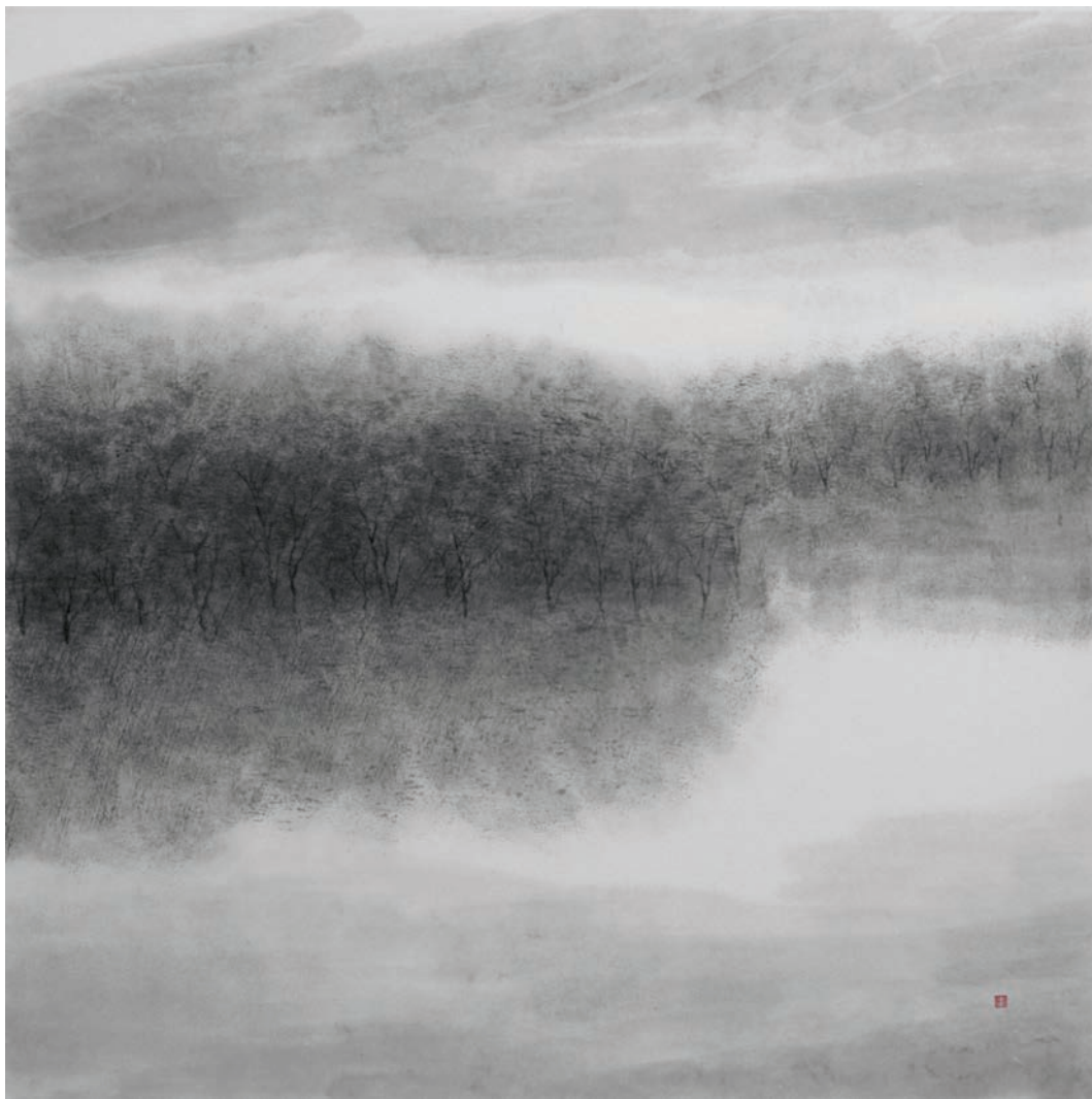
Wetland #0115, 2015. Chinese ink on rice paper, 69 x 69cm