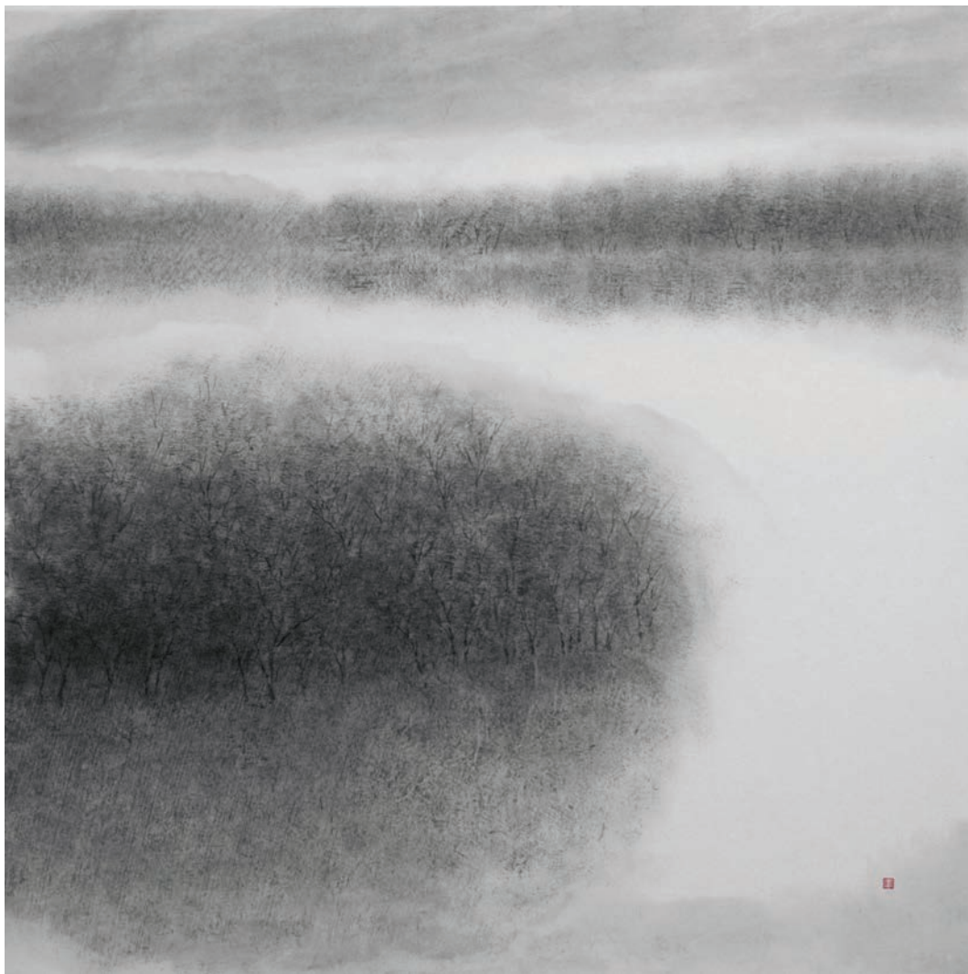
Wetland #0215, 2015. Chinese ink on rice paper, 69 x 69cm