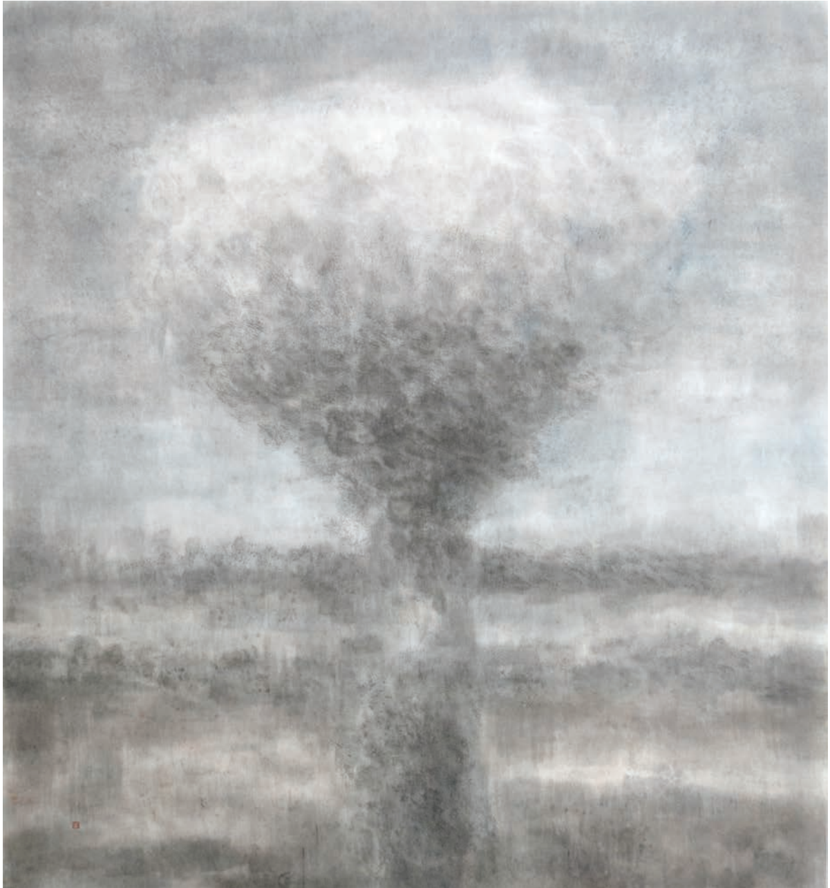
The Cloud #1, 2015. Chinese ink on rice paper, 97 x 90 cm