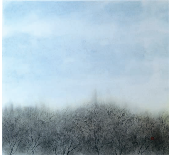
The rain is coming #0215, 2015. Chinese ink on rice paper, 45 x 48 cm