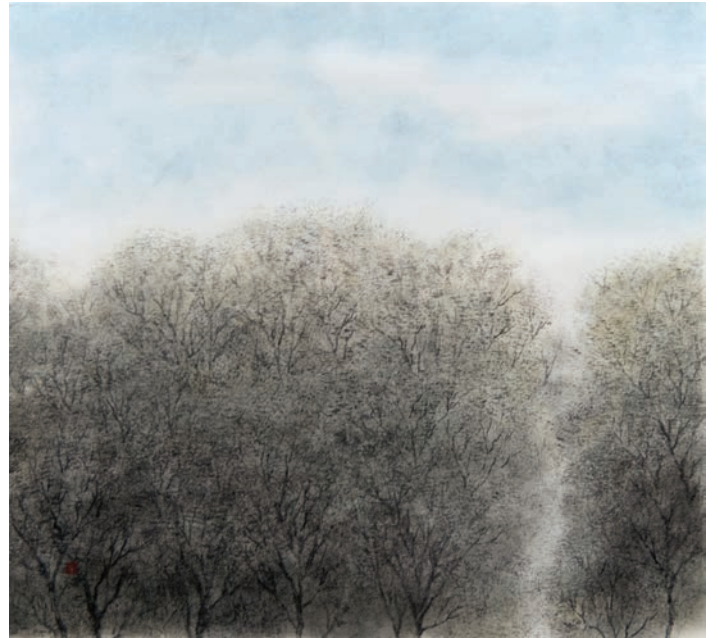
After eden #0315, 2015. Chinese ink on rice paper, 45 x 48 cm