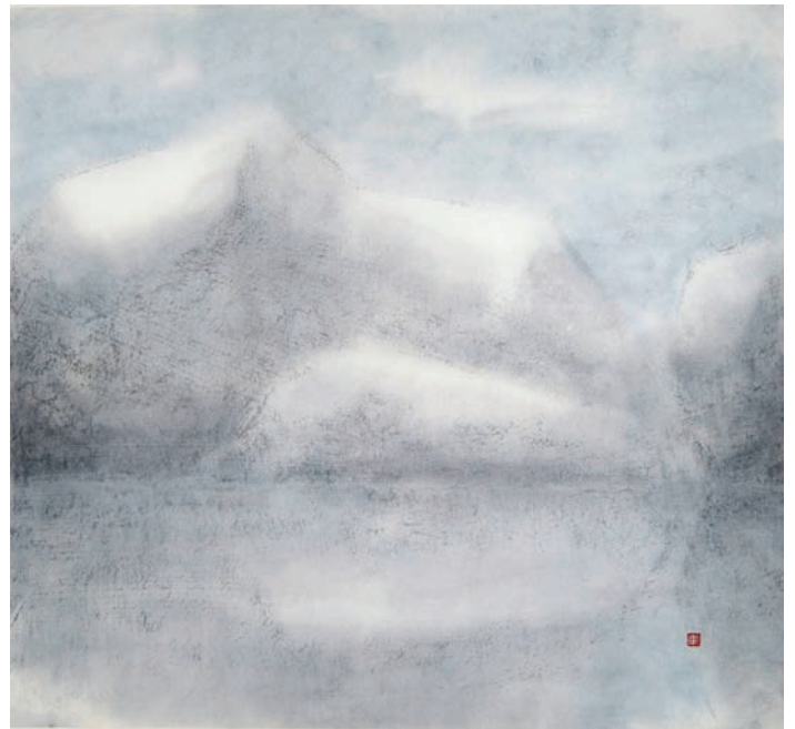
Iceberg studies #0115, 2015. Chinese ink on rice paper, 45 x 48 cm