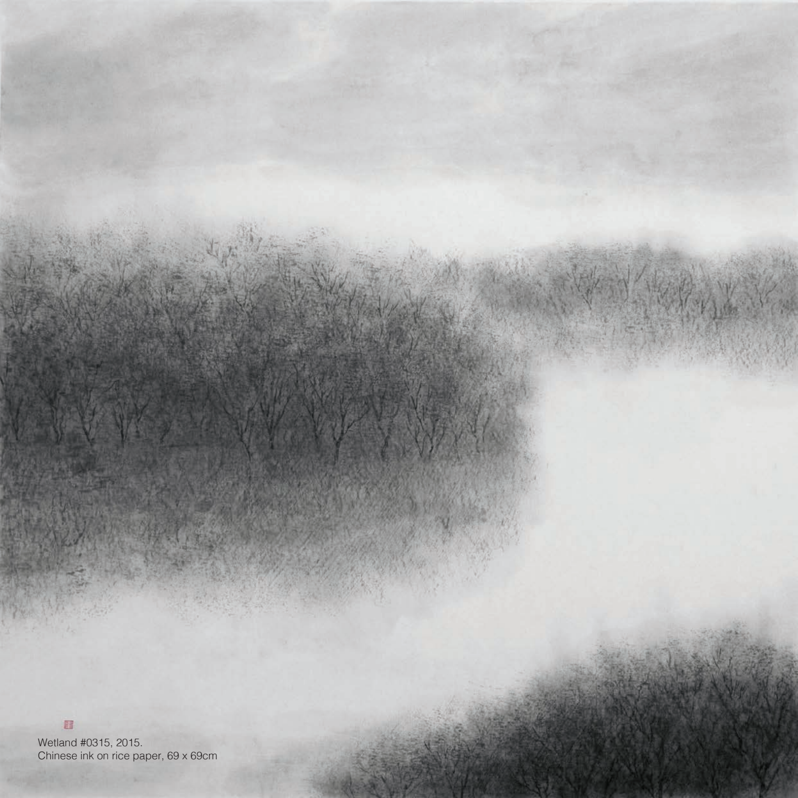
Wetland #0315, 2015. Chinese ink on rice paper, 69 x 69cm