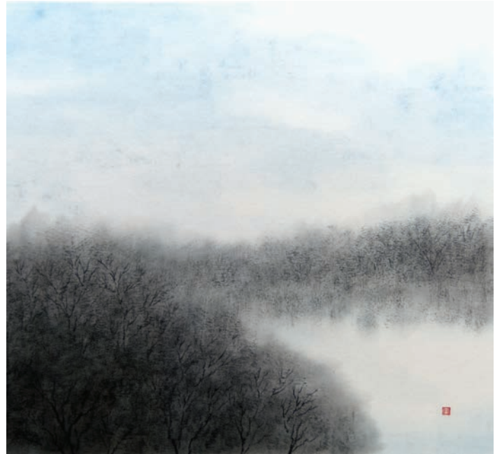
Wetland #0415, 2015. Chinese ink on rice paper, 45 x 48 cm