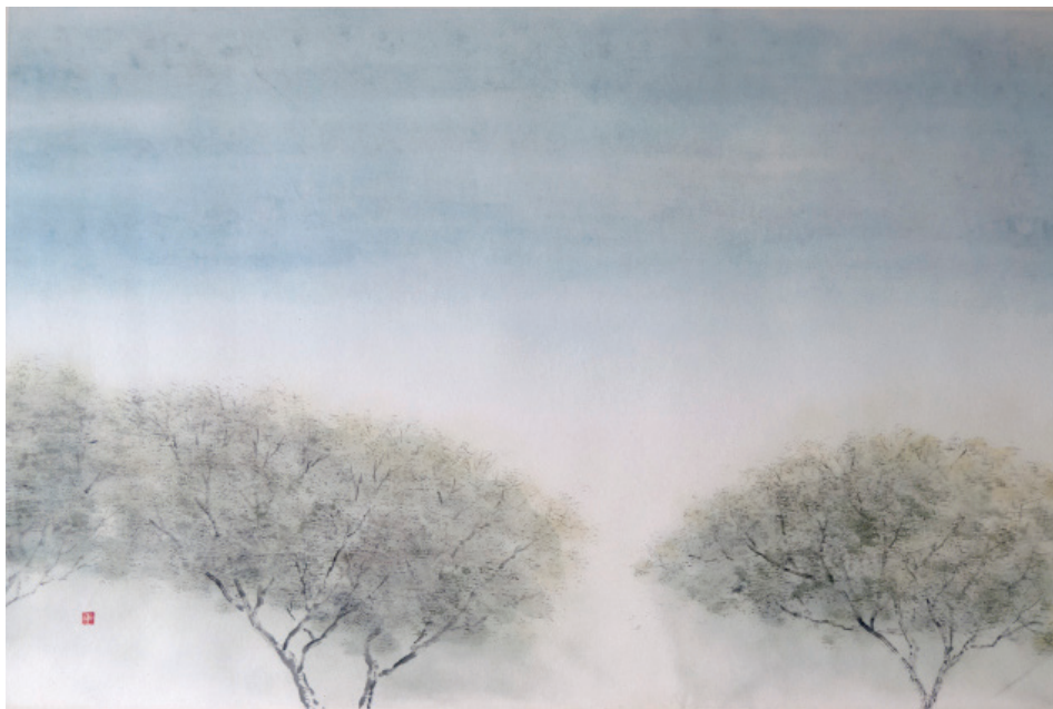
The rain is coming #01, 2014. Chinese ink on rice paper, 46 x 70 cm