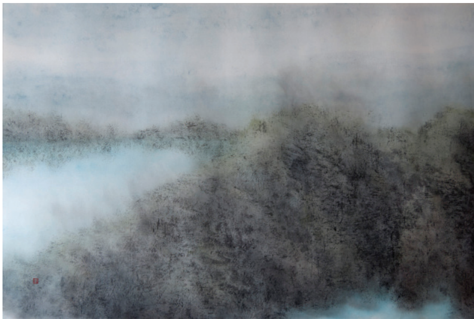
Archipelago studies #1, 2014. Chinese ink on rice paper, 46 x 70 cm (Private Collection)