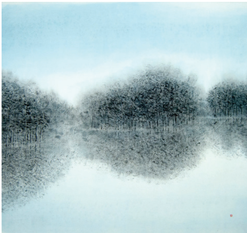
Wetland #05, 2014. Chinese ink on rice paper, 90 x 97 cm (Private Collection)