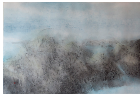
Archipelago studies #3, 2014. Chinese ink on rice paper, 46 x 70 cm