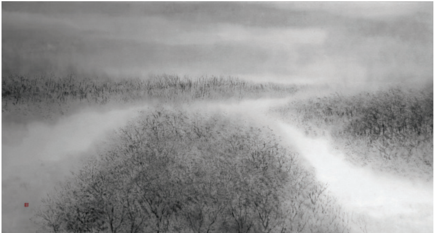
Wetland #08, 2014. Chinese ink on rice paper, 48 x 90 cm (Private Collection)