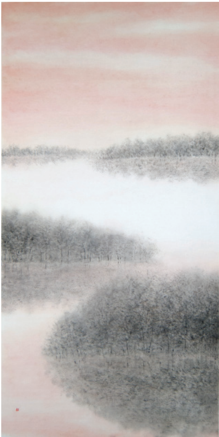
Wetland #07, 2014. Chinese ink on rice paper, 138 x 69 cm