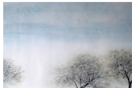
The rain is coming #03, 2014. Chinese ink on rice paper, 46 x 70 cm