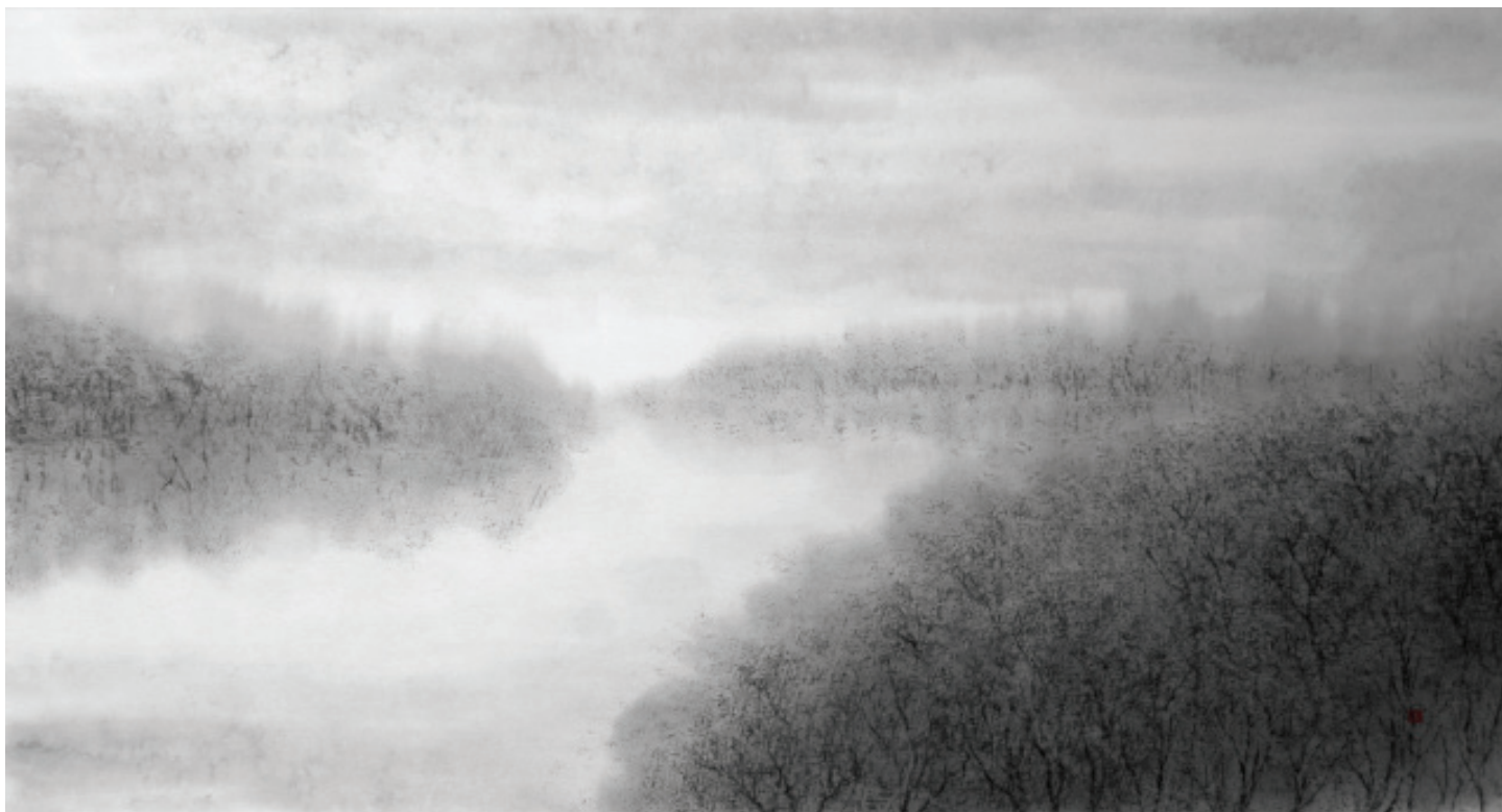
Wetland #09, 2014. Chinese ink on rice paper, 48 x 90 cm (Private Collection)