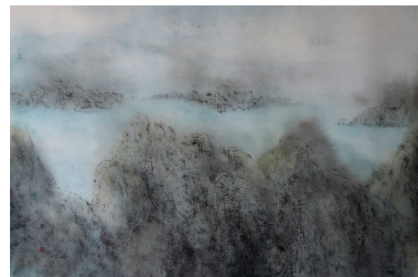
Archipelago studies #2, 2014. Chinese ink on rice paper, 46 x 70 cm