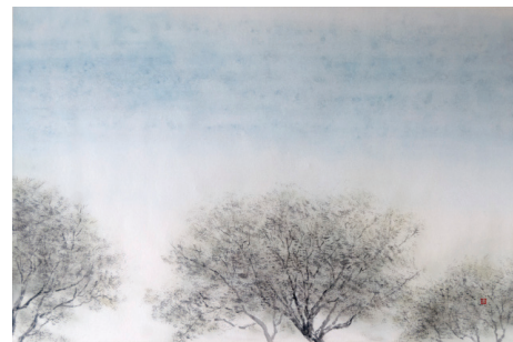
The rain is coming #02, 2014. Chinese ink on rice paper, 46 x 70 cm