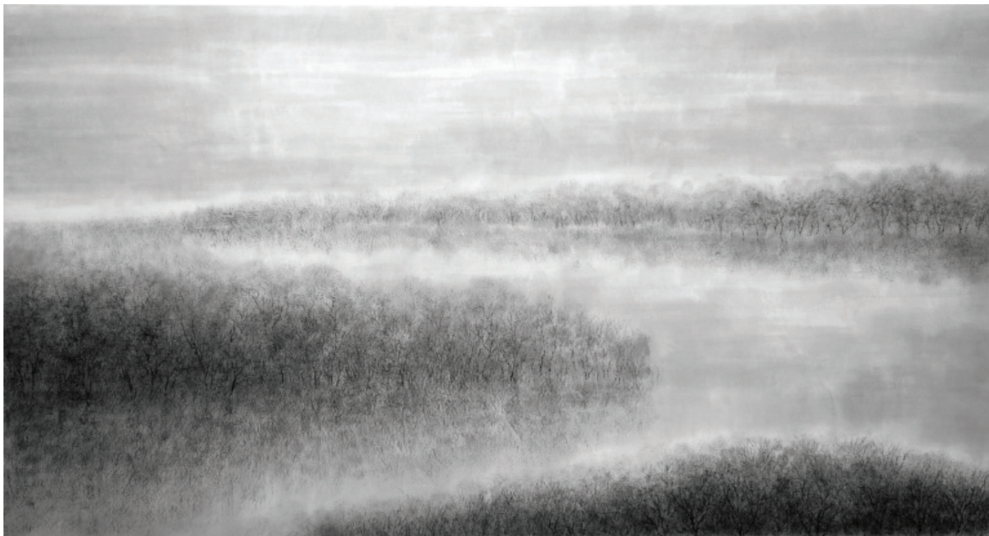
Wetland #11, 2014. Chinese ink on rice paper, 97 x 180 cm