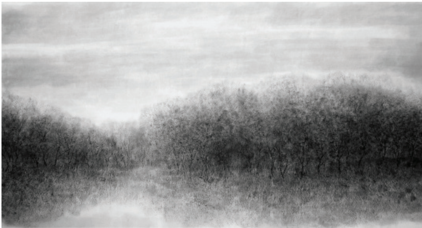
Wetland #10, 2014. Chinese ink on rice paper, 97 x 180 cm